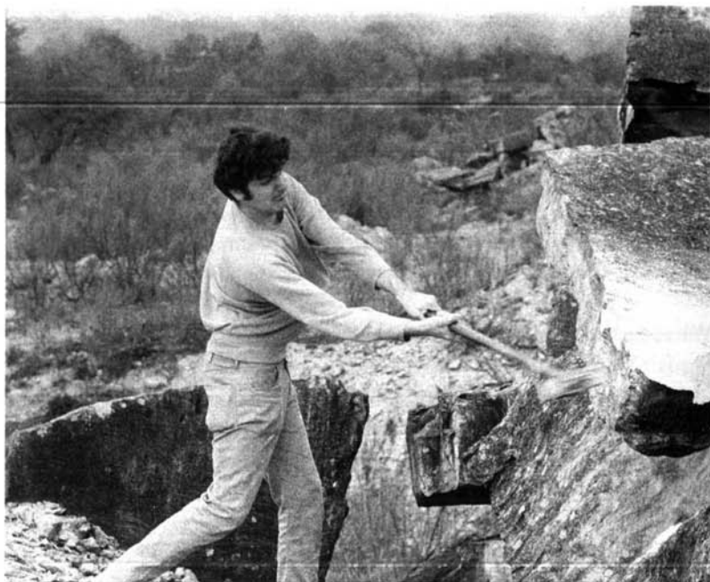
Fig. 11 A participant in Allan Kaprow's Record, 1967, near Austin, Texas.

the public has any familiarity and, incidentally, with which it feels some degree of comfort. Watered down, it has emerged as the stock-in-trade of the discotheque and psychedelic scene.