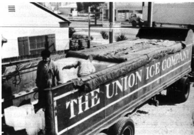
Fig. 15 Delivering ice for Allan Kaprow's Fluids , 1967, Pasadena.

shutting down. Although they had stopped working, they continued working symbolically.