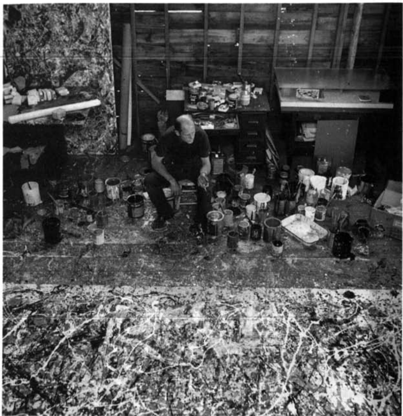
Fig. 1 Jackson Pollock in his studio, 1950.

attached to represented objects and existed more and more on their own, self-sufficiently. But from Impressionism up to, say, Gorky, the idea of an “order” to these markings was explicit enough. Even Dada, which purported to be free of such considerations as “composition,” obeyed the Cubist esthetic. One colored shape balanced (or modified or stimulated) others, and these in turn were played off against (or with) the whole canvas, taking into account its size and shape—for the most part quite consciously. In short, part-to-whole or part-to-part relationships, no matter how strained, were a good 50 percent of the making of a picture (most of the time they were a lot more, maybe 90 percent). With Pollock, however, the so-called dance of dripping,