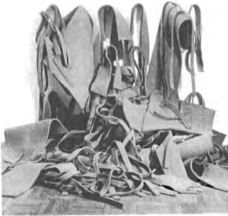
Fig. 12 Robert Morris, Untitled, 1967–68. Felt pieces.

prevails, and prevails, and prevails; there is neither pretense to antiform nor nonform.