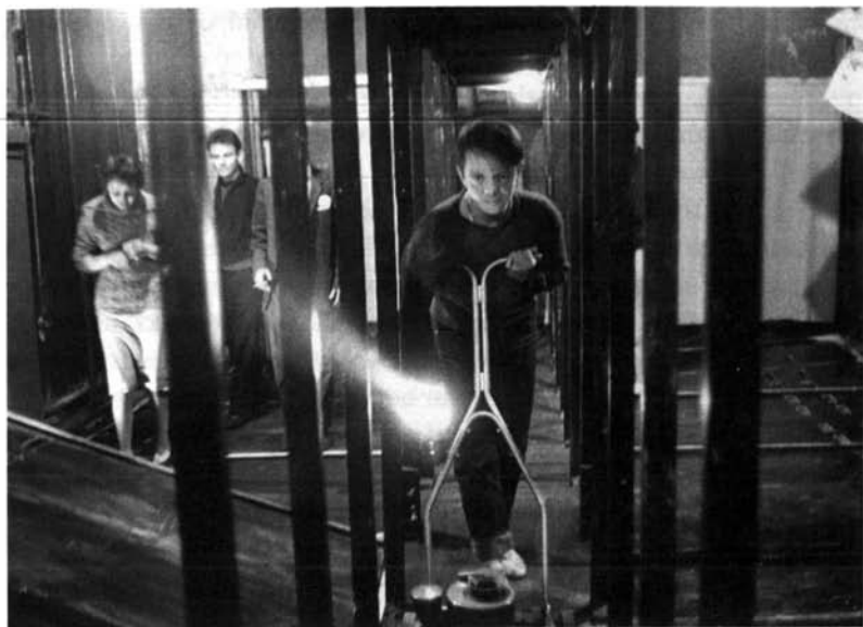
Fig. 3 Allan Kaprow, A Spring Happening , 1961.

normally attentive. They exist for a single performance, or only a few, and are gone forever as new ones take their place.