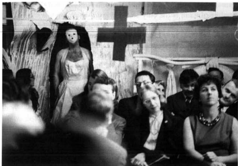
Fig. 5 Jim Dine, Car Crash, 1960.

To us, who are already answering the increasing telephone calls from entrepreneurs, this is more than disturbing. We are, at this writing, still free to do what we wish, and are watching ourselves as we become caught up in an irreversible process. Our Happenings, like all the other art produced in the last decade and a half by those who, for a few brief moments, were also free, are in no small part the expression of this liberty. In our beginning some of us, reading the signs all too clearly, are facing our end.