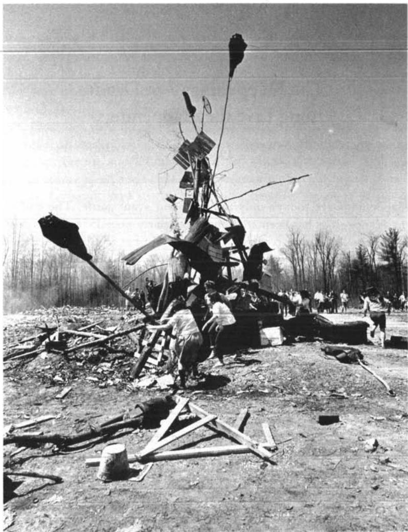
Fig. 10 Allan Kaprow, Household , 1964, near Ithaca, New York.