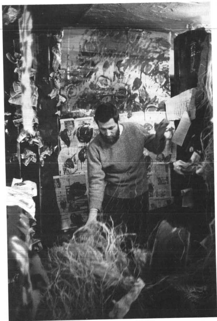
Fig. 2 Allan Kaprow in The Apple Shrine , 1960.