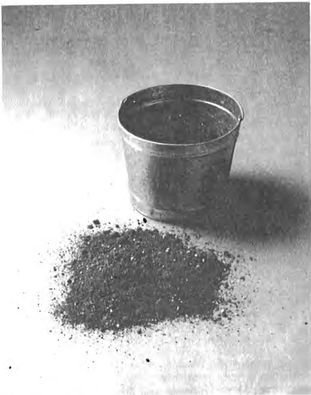
Fig. 14 Bucket and dirt.